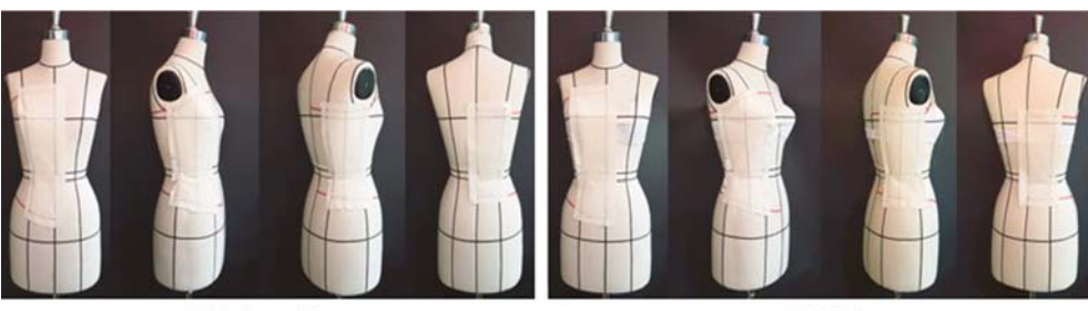
With bra off With bra on