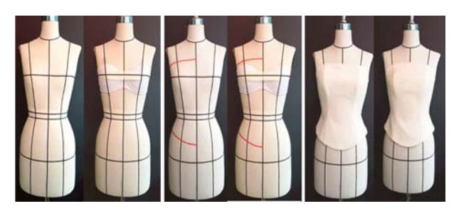
Fig. 4. Dress form, design line tape & experimental clothes.