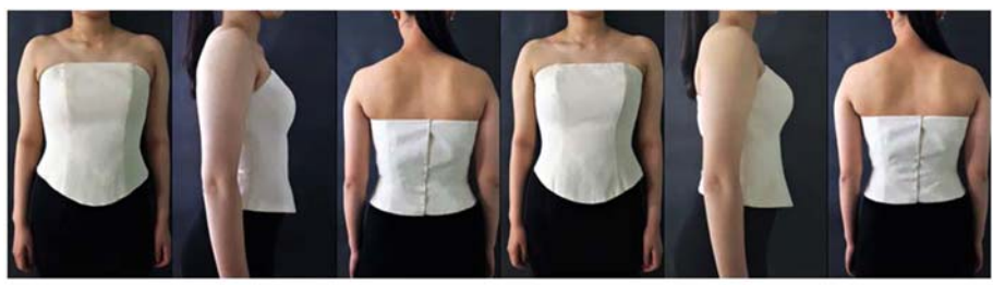
With bra off With bra on